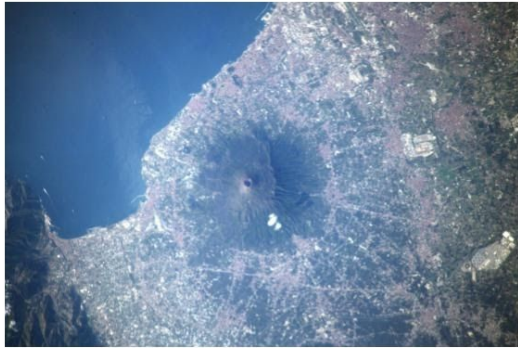
Image from satellites in Space show how large the crater is on Mt. Vesuvio