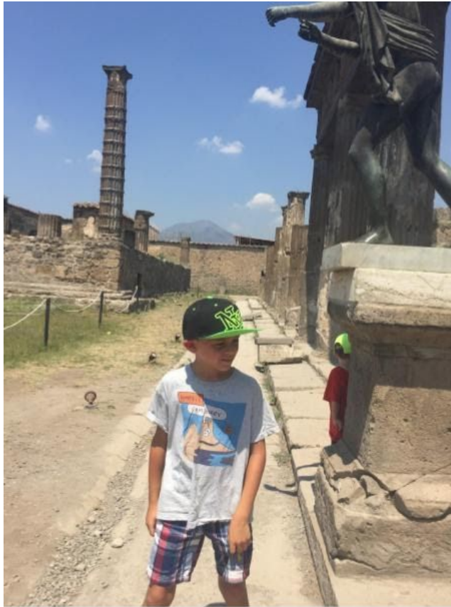
I visited Pompeii and walked around all the ruins. The town is very big. I liked all the stories of Gladiators.

A pyroclastic flow is all the poisonous gases that come out from the explosion. They come down as big clouds.