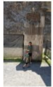
I visited Herculaneum and saw all the ruins which were in better condition than Pompeii

Mount Vesuvius also erupted in 1631 and carried on until 1944. The last eruption we know of caused many people to evacuate their home city which left them homeless.