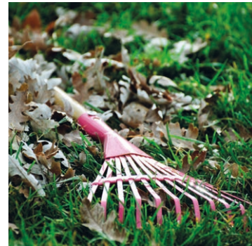
Raking up leaves