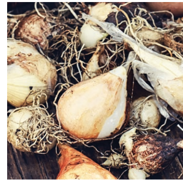
Bulbs ready for planting