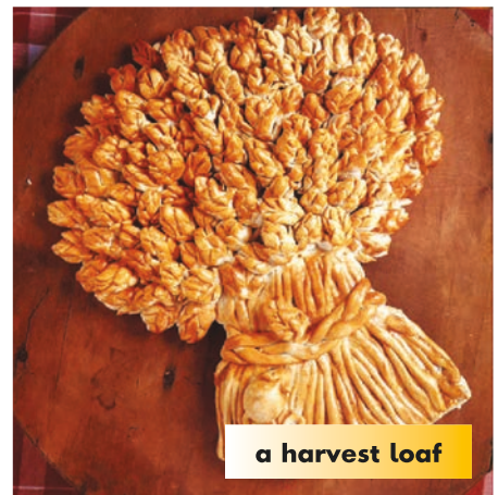
a harvest loaf

Sometimes, bakers will make special harvest loaves. These loaves are shaped like wheat to celebrate the harvest. Wheat is important because it is used in many types of food, including bread.