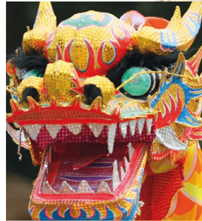
a Chinese dragon puppet

On an island called Jersey, people make giant models of animals, boats and cars out of flowers and take these models on a parade through the island's towns. There is music and dancing. At night, the models are covered in lights and they make the streets sparkle. At the end of the parade, there is a huge firework display.