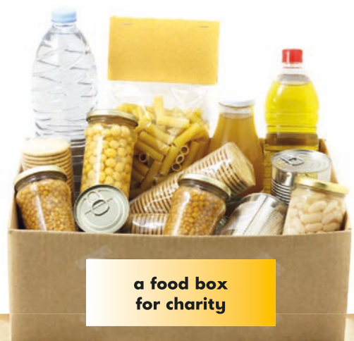
a food box for charity